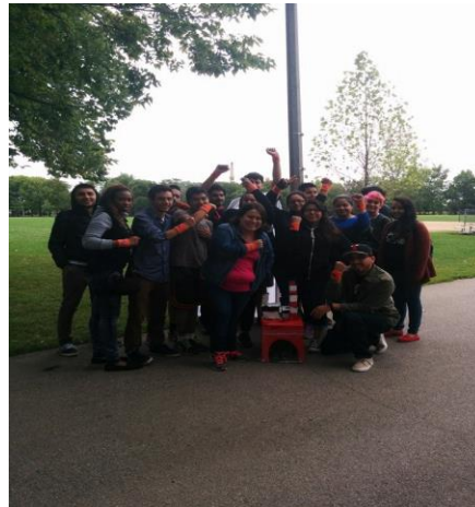
LVEJO Youth Leaders